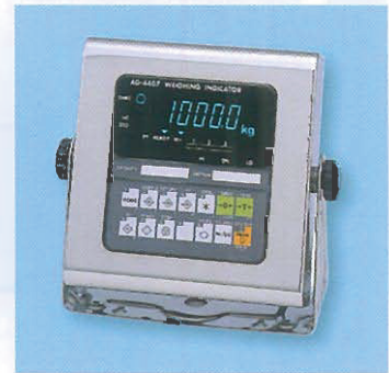
Model AD-4407 Weighing Indicator.