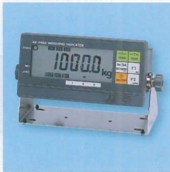
Model AD-4406 Weighing Indicator.