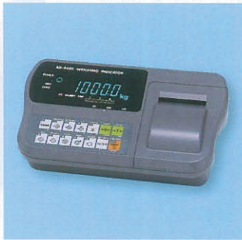
Model AD-4405 Weighing Indicator.