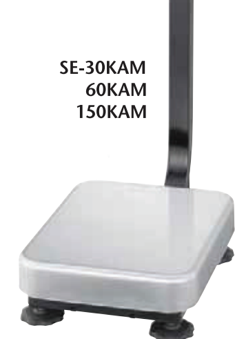
SE-30KAM 60KAM 150KAM