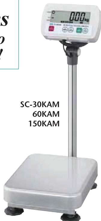
SC-30KAM 60KAM 150KAM