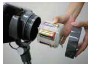
Easily removable battery unit