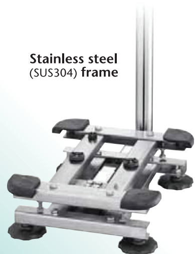
Stainless steel (SUS304) frame