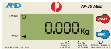
Operator Display & Controls