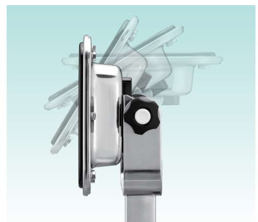
Freely adjustable display angle