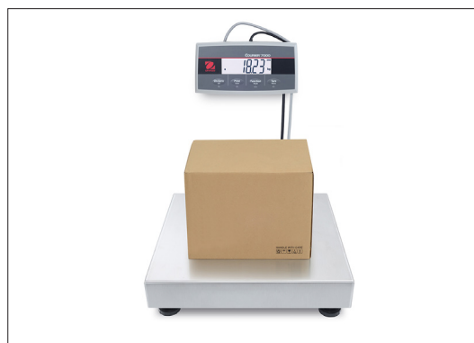
Integrates with shipping system software

Provides simple averaging of weights for unstable loads.