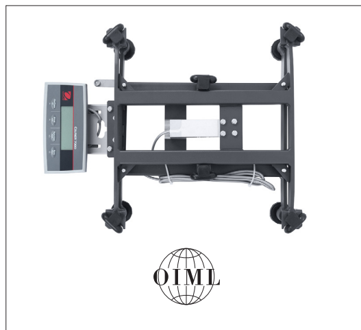
Sturdy powder-coated steel frame holds up to heavy daily shipping use