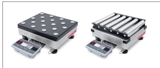
Ball Top and Roller Top Platform Options