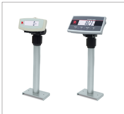
Optional Remote Display on column mount and Column Mount for scale indicator available